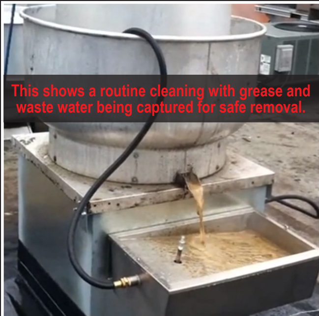
This shows a routine cleaning with grease and waste water being captured for safe removal.

Our enhanced containment system is the only one to collect grease and channel waste water through the duct system.